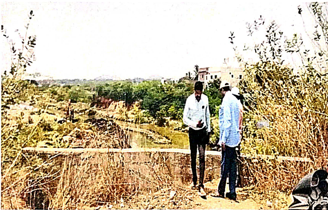
Photos showing desilting and removal of solid waste from inlet drains of Koti cheruvu.