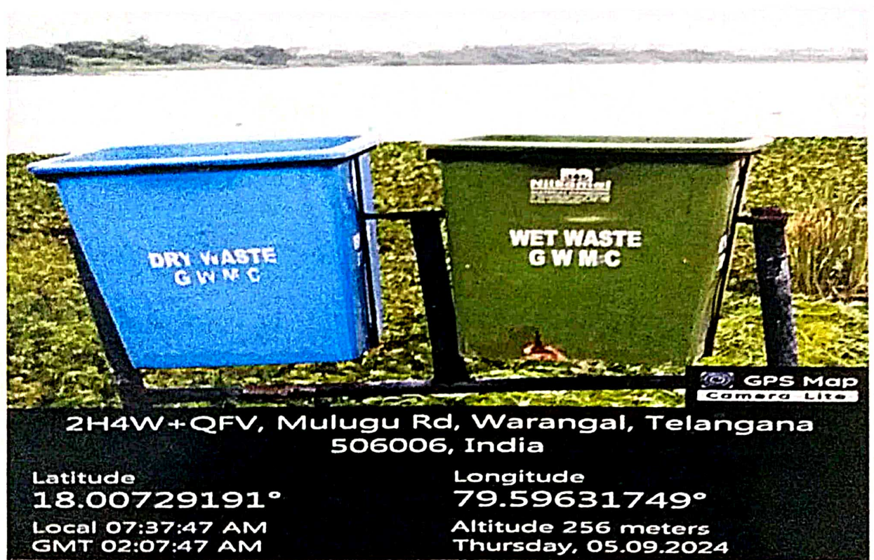
Photos showing bins provided at Koti cheruvu to collect solid waste.