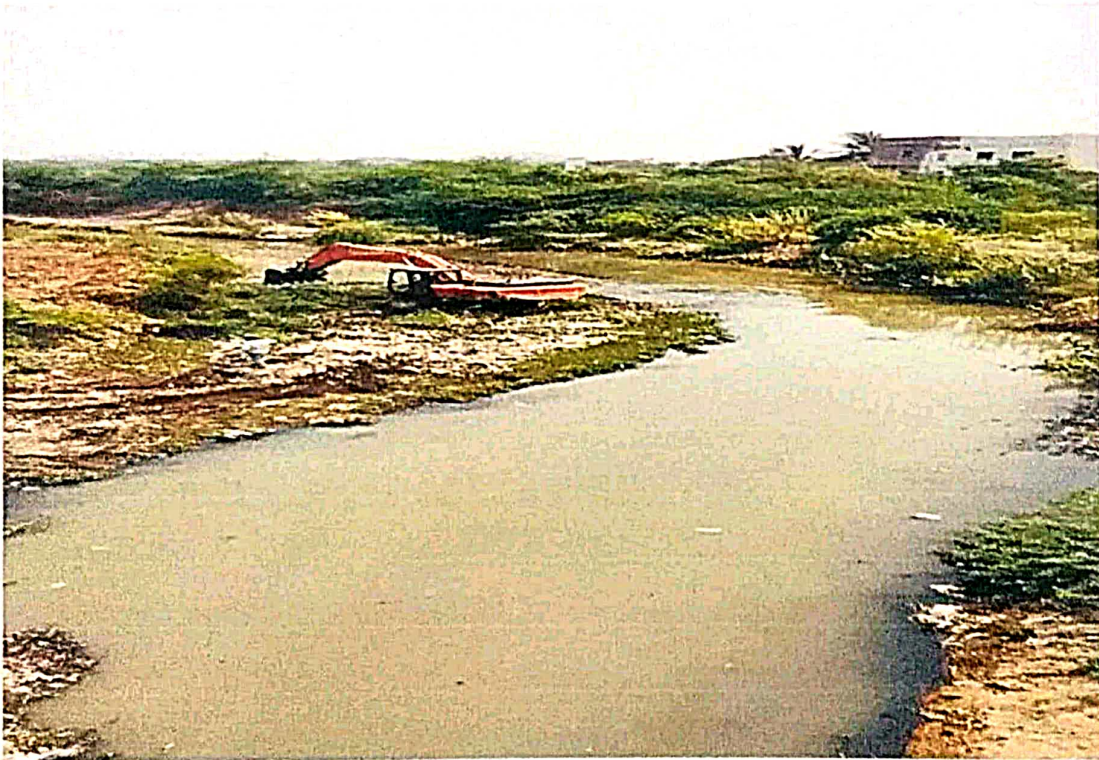
Photos showing desilting and removal of solid waste from inlet drains of Koti cheruvu.